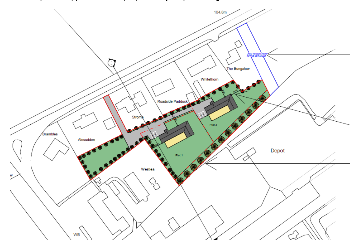
Figure 2: Proposed Layout Plan